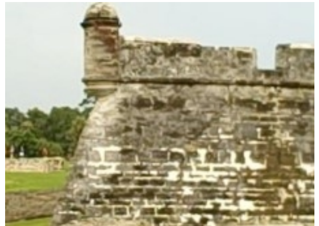
TCCR Staff Photo

From the very first days of the Tea Party’s founding in 2009, politicians and their “Deep State” bureaucrats, including law enforcement, have tried to silence the Tea Party movement—the people’s voice. The Town Criers, a committee of the St. Augustine Tea Party (SATP), are activists. The Town Criers first appeared on the streets in the historic district of St. Augustine, Florida on June 14, 2011. Early on they became aware of the suppression of free speech in the most conservative Republican County in the State of Florida. Free speech was being restricted at federal, state and local levels by restricting the people’s right of assembly on public lands—a direct violation of the First Amendment. These governmental identities did this by forcing people into so-called free speech zones.