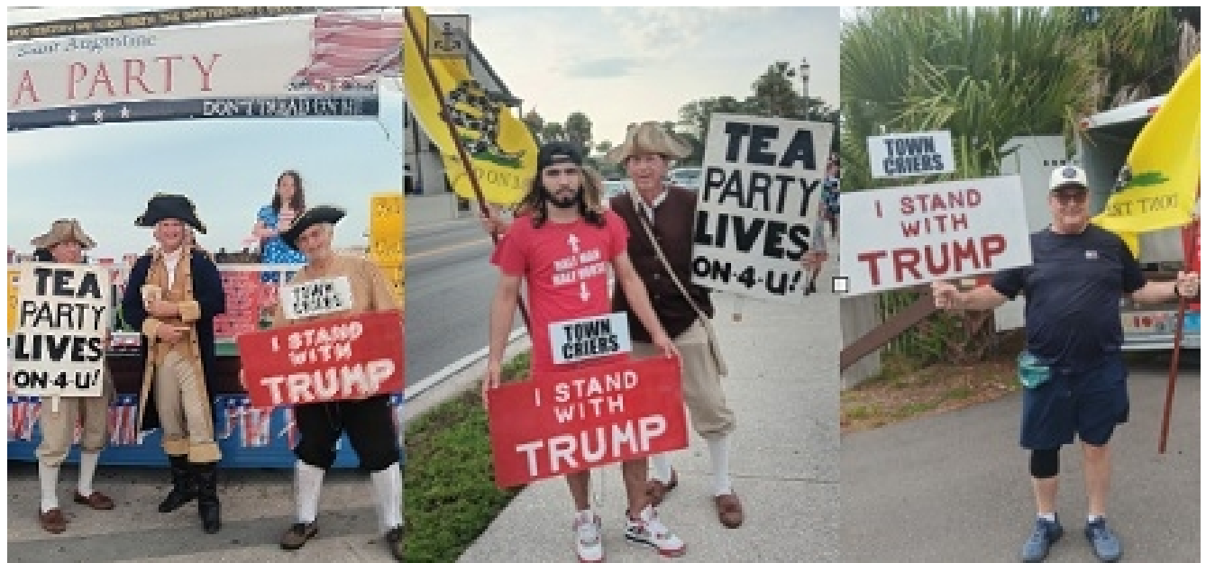
TCCR Staff Photos