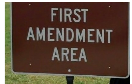
TCCR Staff Photo July 2013

From the very first days of the Tea Party’s founding in 2009, politicians and their “Deep State” bureaucrats, including law enforcement, have tried to silence the Tea Party movement—the people’s voice. The Town Criers, a committee of the St. Augustine Tea Party (SATP), are activists. The Town Criers first appeared on the streets in the historic district of St. Augustine, Florida on June 14, 2011. Early on they became aware of the suppression of free speech in the most conservative Republican County in the State of Florida. Free speech was being restricted at federal, state and local levels by restricting the people’s right of assembly on public lands—a direct violation of the First Amendment. These governmental identities did this by forcing people into so-called free speech zones.