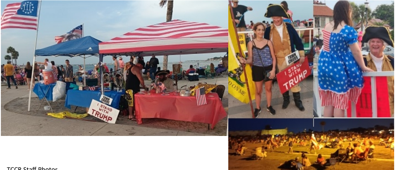
TCCR Staff Photos